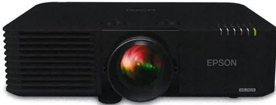
Epson Powerlite L6165U.jpg