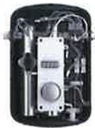
RTEX-08, RTEX-11, RTEX-13