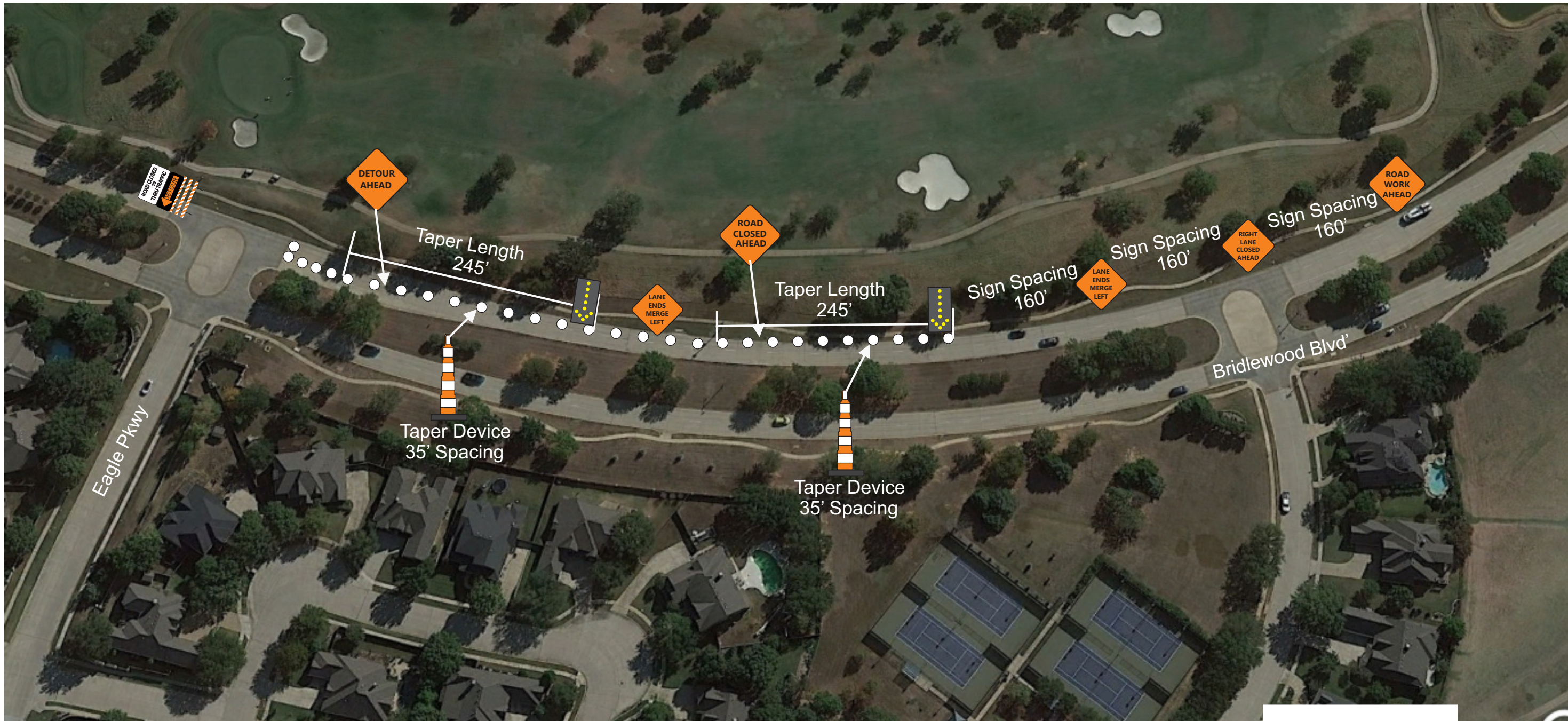
Suggested Advance Warning Sign Spacing for Conventional Highways